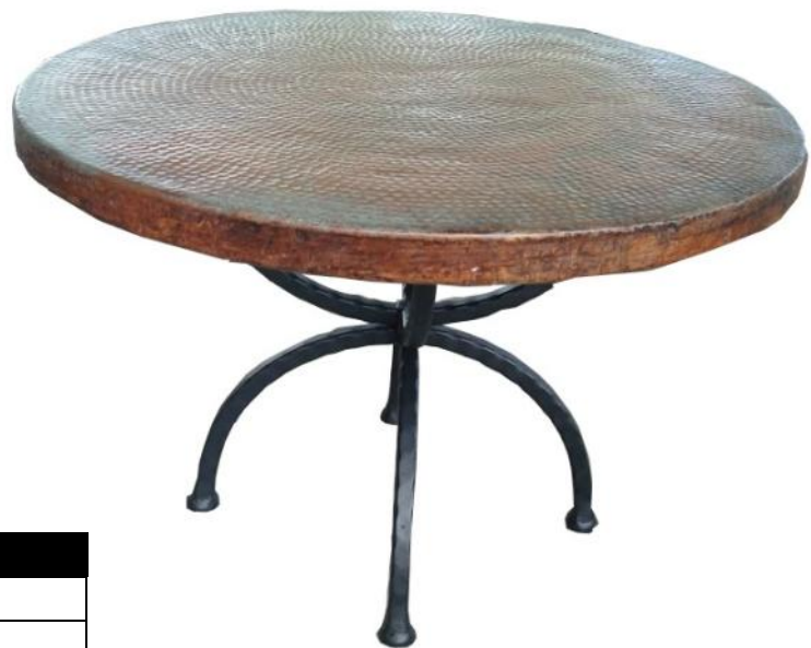
Table Top Sizes